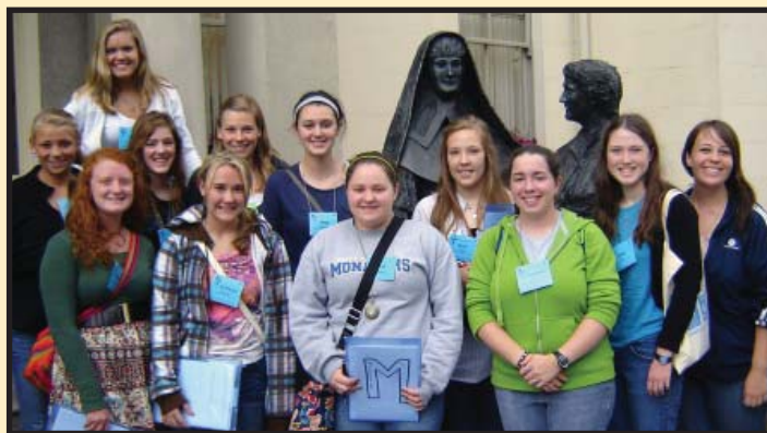
Attendees of the Young Leaders Conference outside of the International House of Mercy.