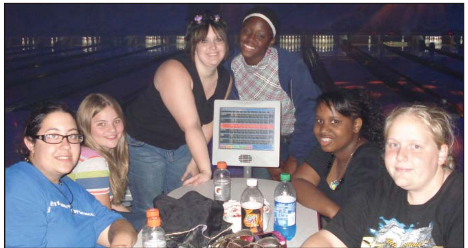
Freshmen and Seniors at the Big Sister/Little Sister bowling outing.